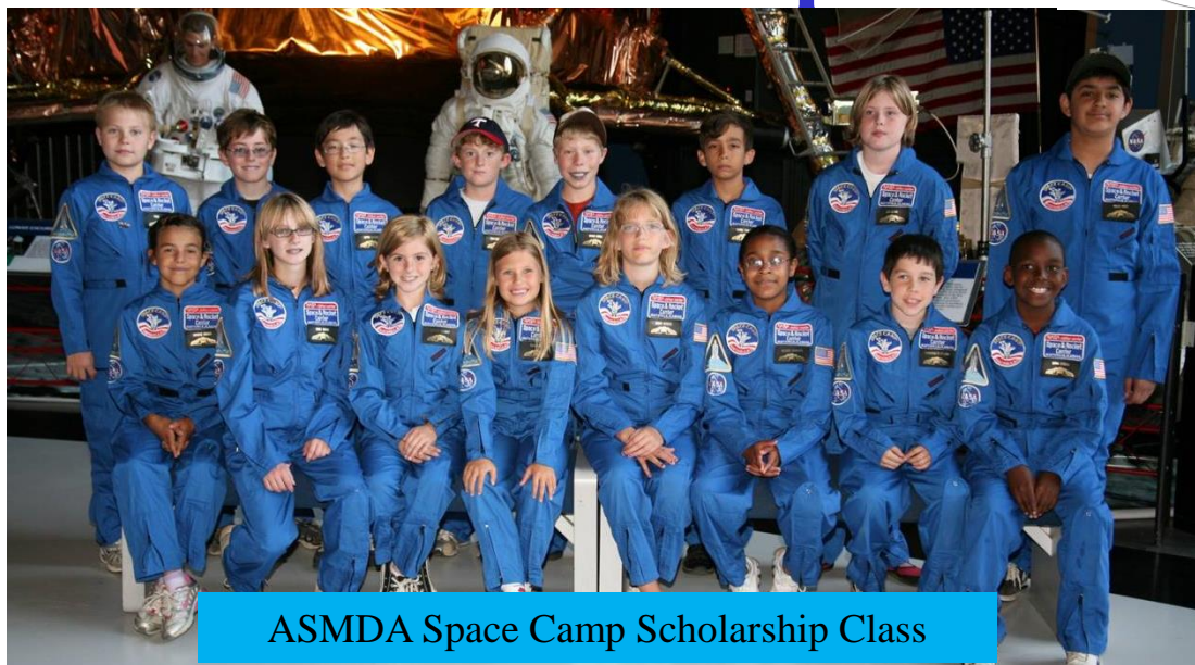
ASMDA Space Camp Scholarship Class

When: Sunday, 29 June 2025 – Friday, 4 July 2025